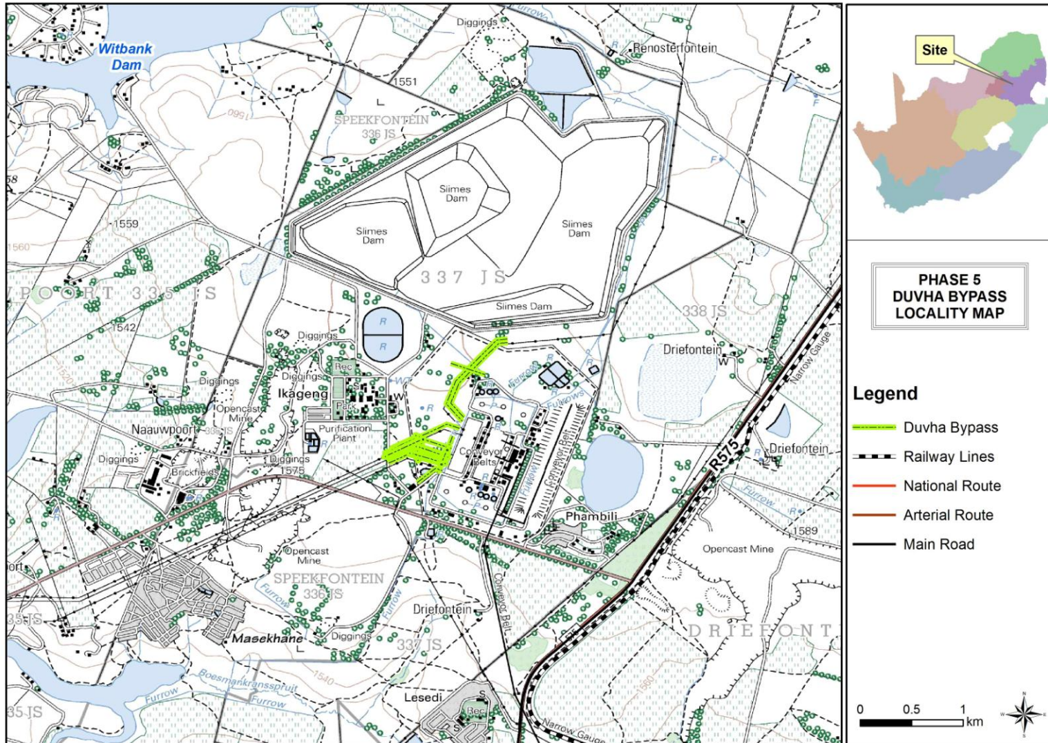
Figure 1: Locality Map